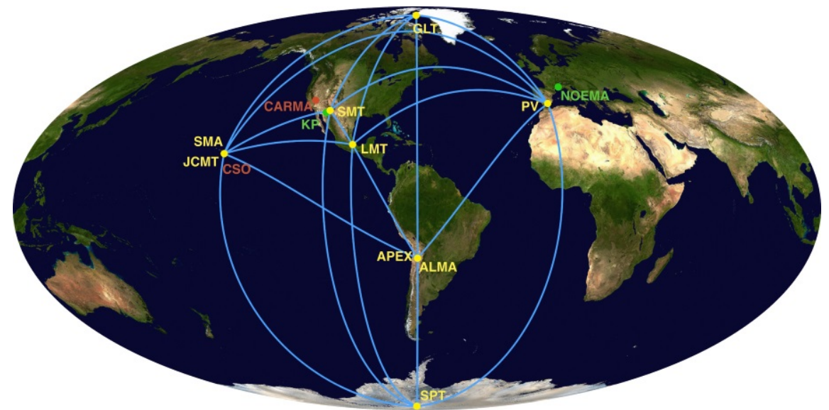
Figure 2. A map of the EHT. Stations active in 2017 and 2018 are shown with connecting lines and labeled in yellow, sites in commission are labeled in green, and legacy sites are labeled in red. From Paper II (Figure 1).

Over the past decade, the EHT extended these first measurements of size to mount the more ambitious campaign of imaging the shadow itself. During 5-11 April 2017, the Event Horizon Telescope (EHT) observed M87 and calibrators on four separate days using an array that included eight radio telescopes at six geographic locations: Arizona (USA), Chile, Hawai'i (USA), Mexico, the South Pole, and Spain (Figure 2). Years of preparation (and an astonishing spate of planet-wide good weather) paid off with an extraordinary multi-petabyte yield of data. The results presented here, from observations through images to interpretation, issue from a team of instrument, algorithm, software, modeling, and theoretical experts, following a tremendous effort by a group of scientists that span all career stages, from undergraduates to senior members of the field. More than 200 members from 59 institutes in 20 countries and regions have devoted years to the effort, all unified by a common scientific vision.